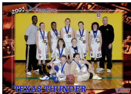
SAMPLE OF 5X7 TEAM PHOTO