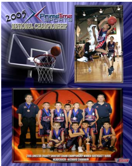
SAMPLE OF 8X10 MEMORY MATE

Don't Miss This Opportunity to Make Some Money for Your Team While Providing Them With Quality Photographs to Commemorate Your National Championship Experience!!!